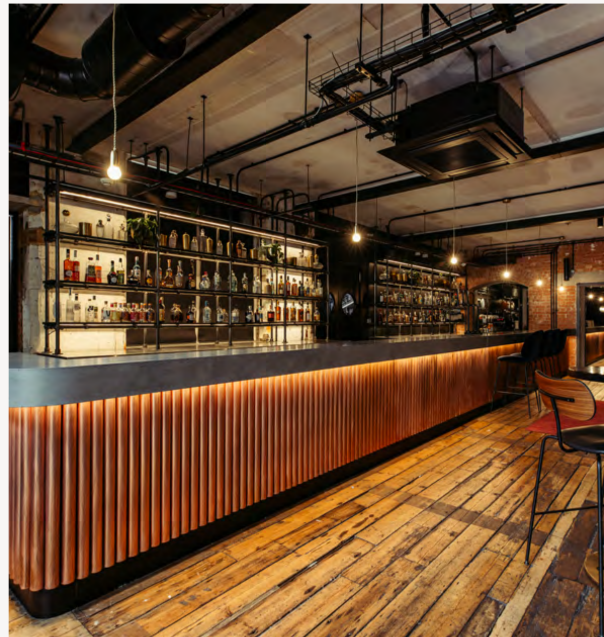
THE BAR & GARDEN