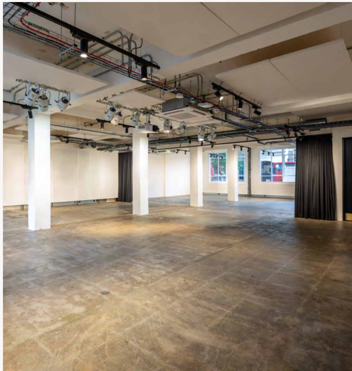
THE WHITE SPACE

Begin your journey in The White Space, a versatile space that transitions seamlessly from ceremony to dinner, offering a blank slate for your unique vision. Move on to The Bar & Garden and The Lounge, where celebrations come to life in a vibrant atmosphere. Finally, our Private Dining Rooms are perfect for a band green room, or as a relaxing bridal space away from the action. Whether combined or experienced individually, each space is meticulously designed to ensure your wedding unfolds effortlessly, reflecting your distinct love story.