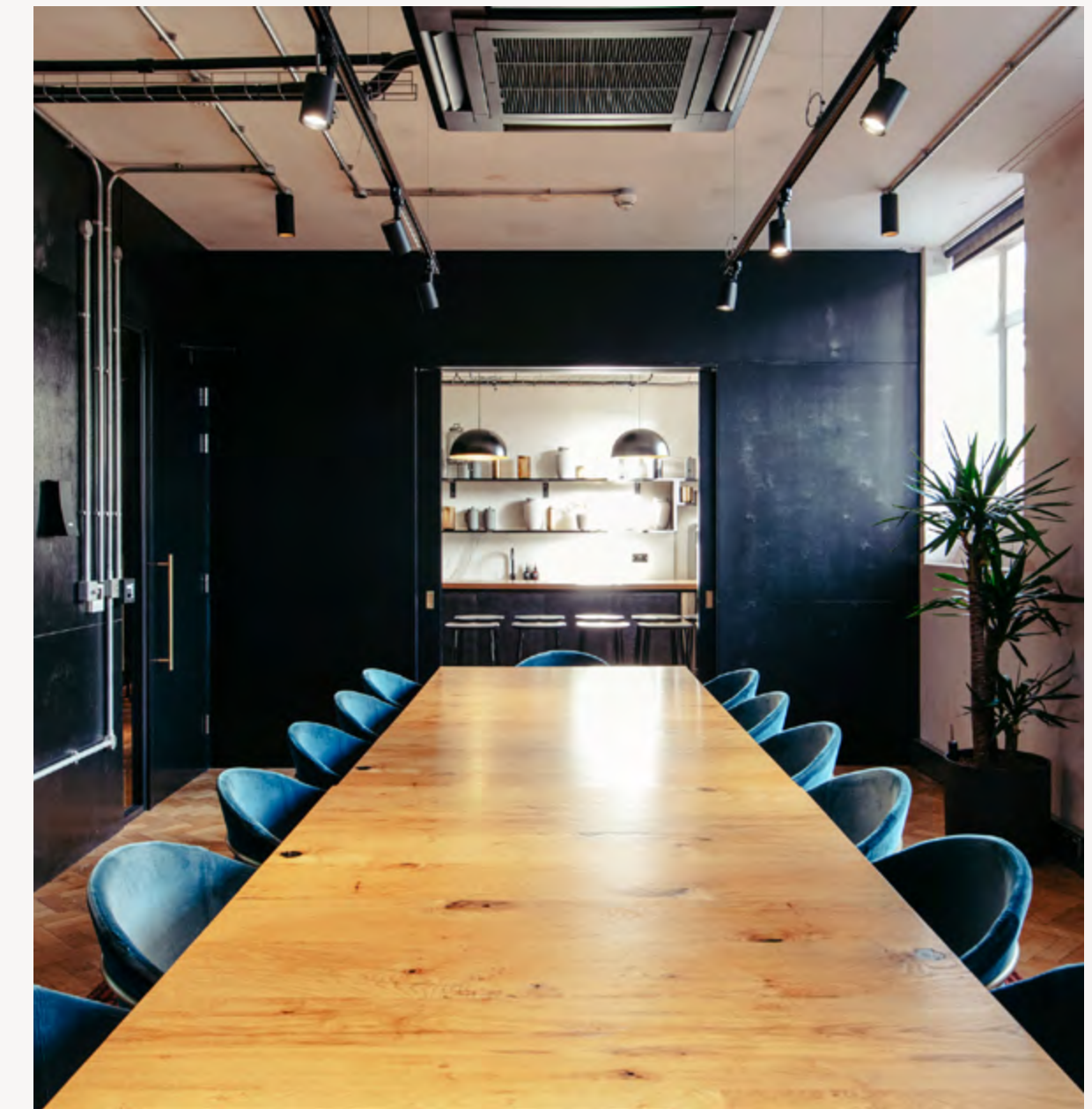
PRIVATE DINING ROOMS